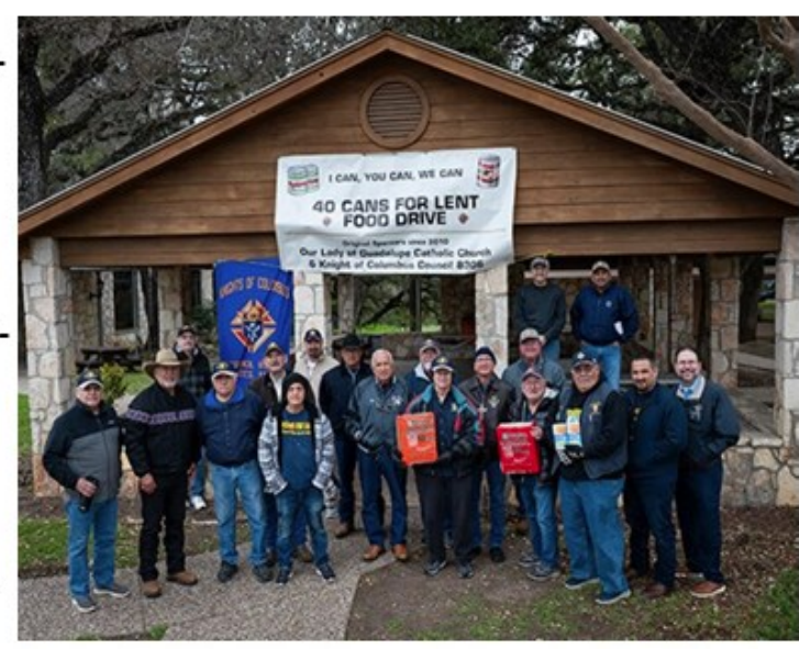
Members of Our Lady of Guadalupe Council 8306 in Helotes, Texas, kick off their 14th annual 40 Cans for Lent food drive with a special collection outside Our Lady of Guadalupe Church on Feb. 17.

Chaput wasted no time bringing the plan to his brother Knights in Our Lady of Guadalupe Council 8306 in Helotes, Texas, and the council held its first "40 Cans for Lent" food drive at Our Lady of Guadalupe Parish in March 2011.